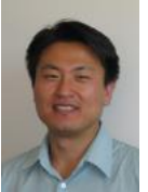
Hyle Park Bioengineering Parliamentarian